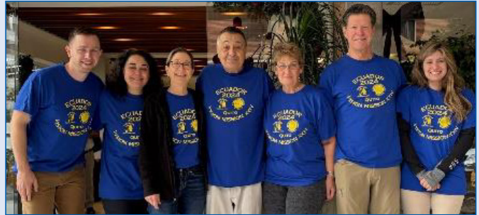
Our 2024 Ecuador Mission Team