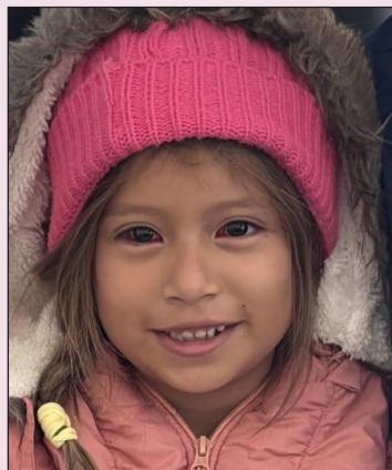
Child with Strabismus - Before and After Surgery