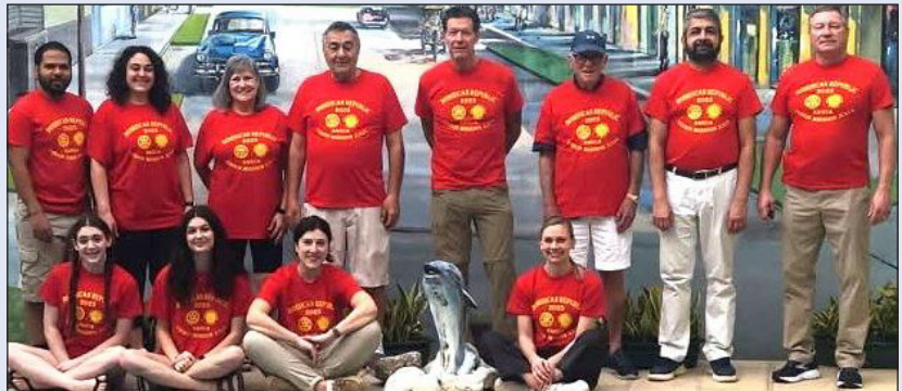
Our 2025 Dominican Republic Mission Team