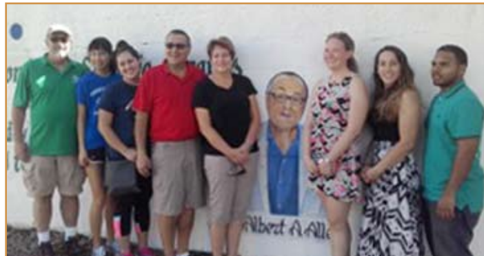
Dominican Team members gather in front of what has become somewhat of a WBO landmark. This wall/mural honors the 22-year commitment of WBO Teams to the people of the Dominican Republic.