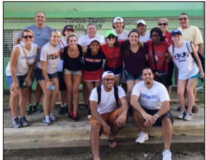
Student volunteers, adult chaperones and WBO team members proudly pose in front of their recently completed masterpiece - the freshly painted Linda Alley Clinic in La Pascuala.

Through their work, they developed relationships with local students and Rotarians and have continued to communicate via social media. They worked during the day and engaged in a variety of social and