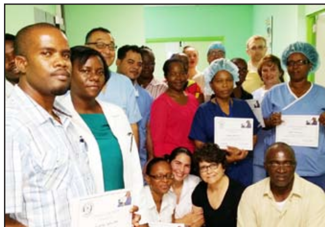
Staff at Milton Cato Hospital receiving Certificates of Recognition for working with our World Blindness Outreach team.

While our team may have experienced travel inconveniences, we're reminded that we have the ability to travel and help those without the gift of sight. It is through these experiences that we are reminded of our many blessings and count each of you as one.