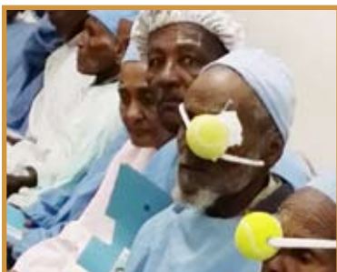
In Ethiopia, like many places we visit, we see tremendous need. Those pictured at left patiently await their turn in surgery.