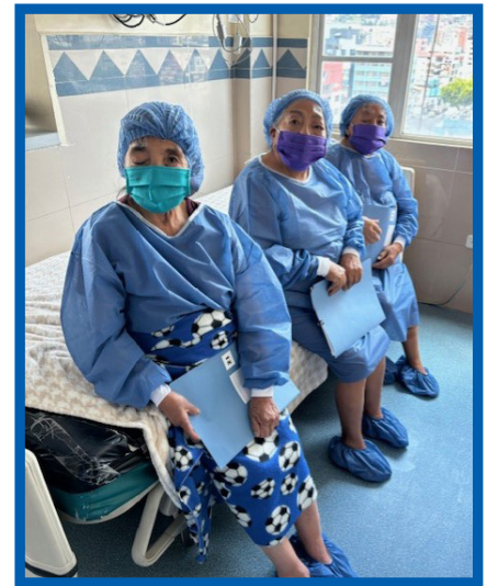
Three patients waiting to go into the operating room for surgery.

Thanks to all who contributed to another successful trip – especially our regular host and long-term partner, Vista Para Todos, who provides the surgical facility and additional support personnel.