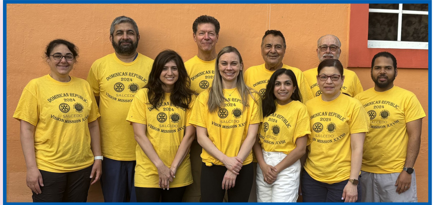
WBO Team to Dominican Republic