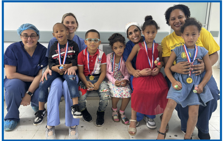
Happy patients after corrective strabismus procedures.

eyes and his original surgery in 2004 was a complete success. Unfortunately, over time, a transplanted